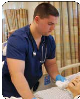
Quality programs that get you hired!