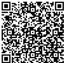
Test Preparation Information